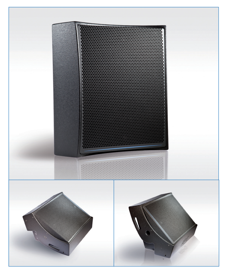
Multi purpose DX15 speaker in FOH and floor monitor

The 15APT90 option is an angle tuning plate with the ETDX15 bracket that is hidden in the sides of the cabinet. The QFS4 comprises 4 parts for a quick and secure hanging with bolts or pins. The DX15 works in mono amplification and requires the use of an APG processor in the musical high power applications. For low and very low frequency reinforcement, subs APG are recommended.